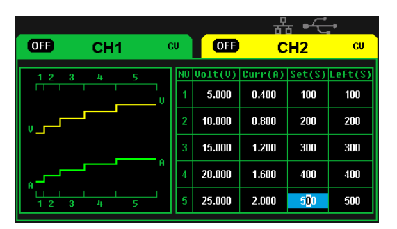
Panel timing output

Through front panel operation, 5 groups of timing settings and output control can be displayed, which provides users a simple power programming function. Also a connection can be made with Siglent's EasyPower PC software providing a full range of communication and control requirements.