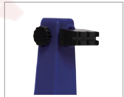
4 different thickness holders