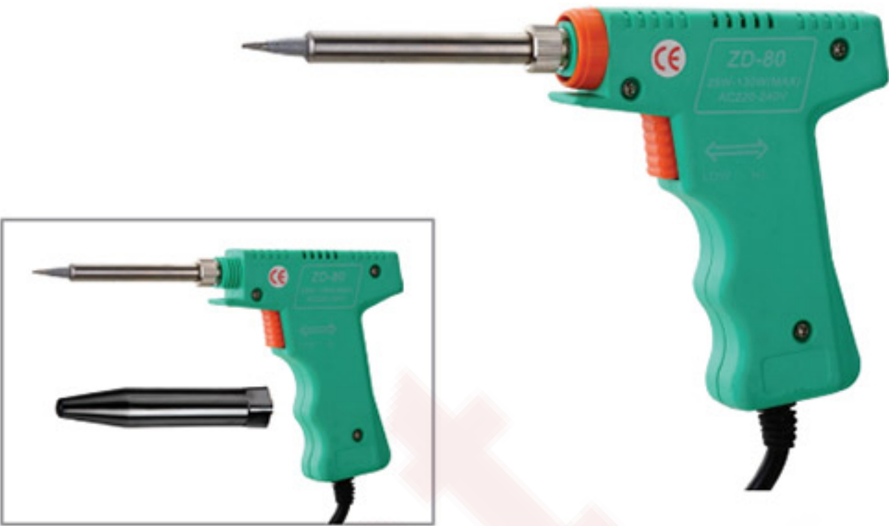
ZD-80A (with cover)

Model: ZD-80 Note: with cover model ZD-80A