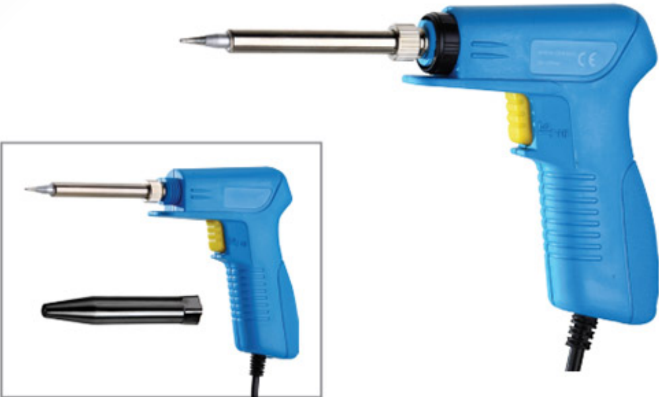
ZD-81NA (with cover)

Model: ZD-81N Note: with cover model ZD-81NA