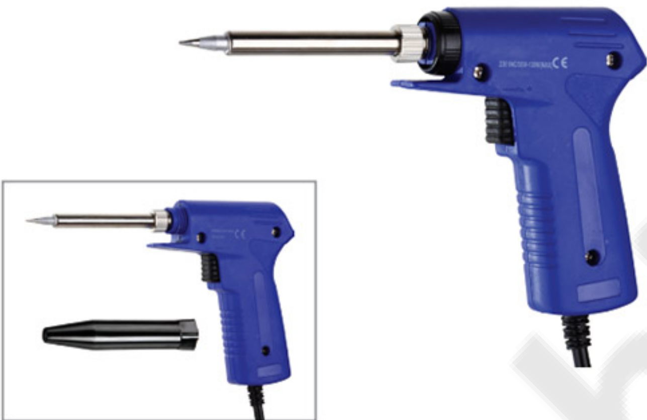
ZD-90A (with cover)