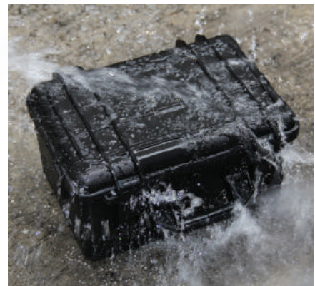
Water-tight seal for equipment protection