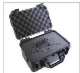
Comes with Pick and Pluck foam.