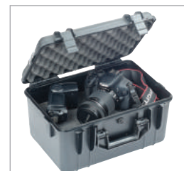
Ideal for carrying valuable precision equipment and instruments...etc.