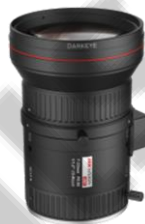
HV0733D-6MP 7 to 33 mm DC Iris