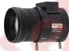
HV1250D-MPIR 12 to 50 mm DC Iris