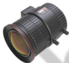
HV3816P-8MPIR 3.8 to 16 mm P-iris