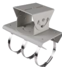
DS-1214ZJ Horizontal Pole Mount