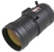
HV1140P-8MPIR 11 to 40 mm P-Iris