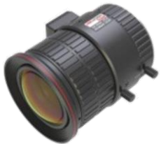
HV3816D-8MPIR 3.8 to 16 mm DC Iris