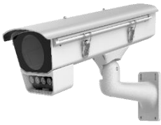
DS-1331HZ-B Outdoor Housing + DS-2202ZJ Integrated Mount