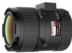
HV0415D-4MP 4 to 15 mm DC Iris