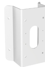
DS-1476ZJ-SUS Corner Mount