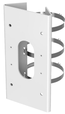
DS-1475ZJ-SUS Vertical Pole Mount