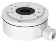
DS-1280ZJ-XS Junction Box