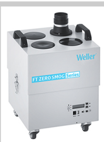
Fume extraction devices