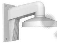
DS-1473ZJ-155 Wall Mount