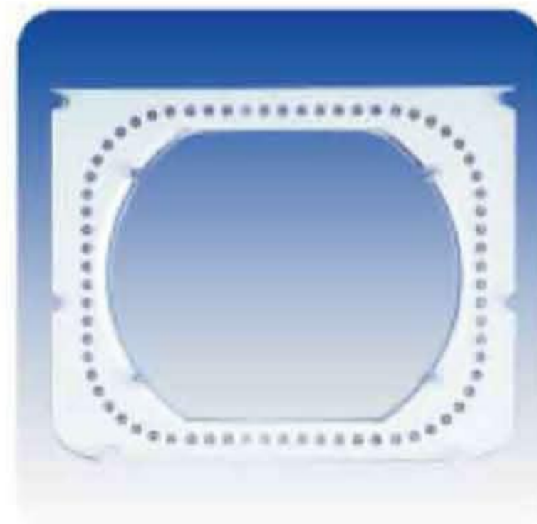
Straw Hat LED