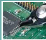
Individual packing: Blister card