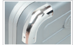
Heavy duty metal protective corners