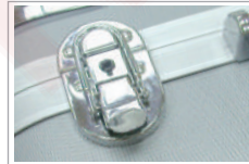
Key locks for maximum security

Removable divider Lining and partitions: EVA