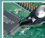
Individual packing: Blister card